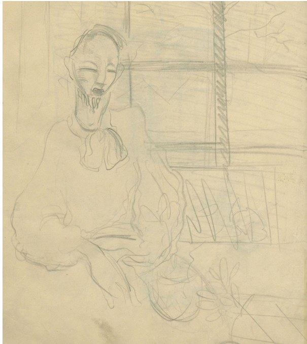
Detail of Leonora Carrington, Untitled , ca. 1934-35

FLEISS-VALLOIS 1018 Madison Ave, FL 5 & PH FLEISS-VALLOIS.COM