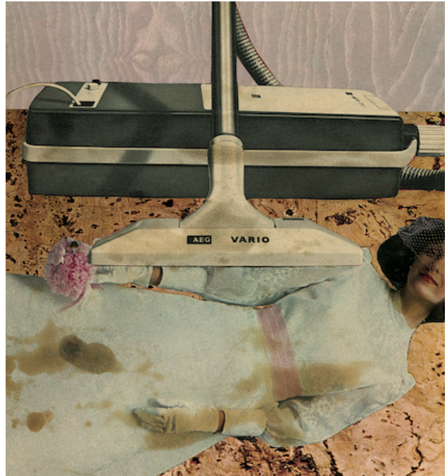
Detail of Eulàlia Grau, Collage Etnografia - Aspiradora , 1973