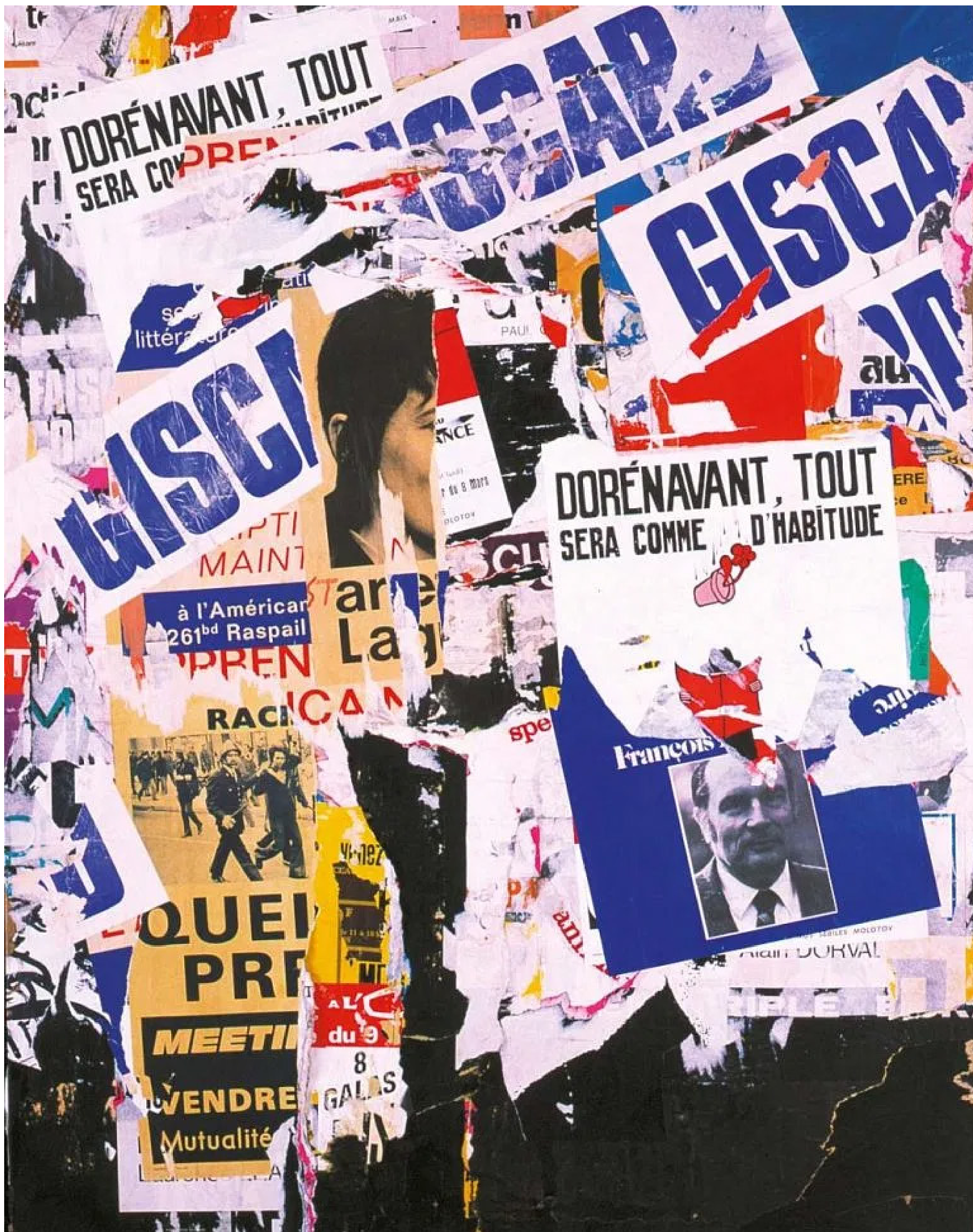
JACQUES VILLEGLE, 99, Rue du Temple, 1974.