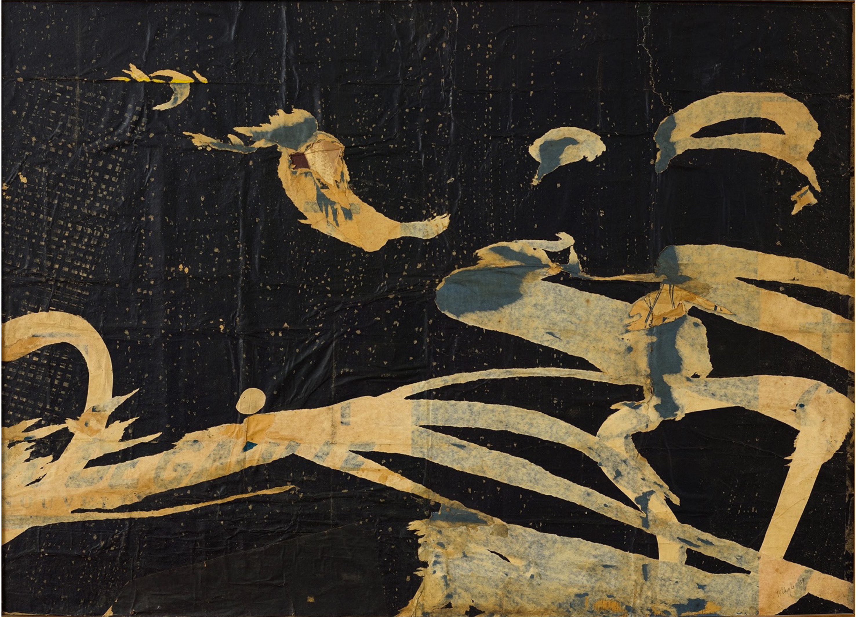
JACQUES VILLEGLE, Avenue Colette Villiers, 25 janvier 1959, 1959.