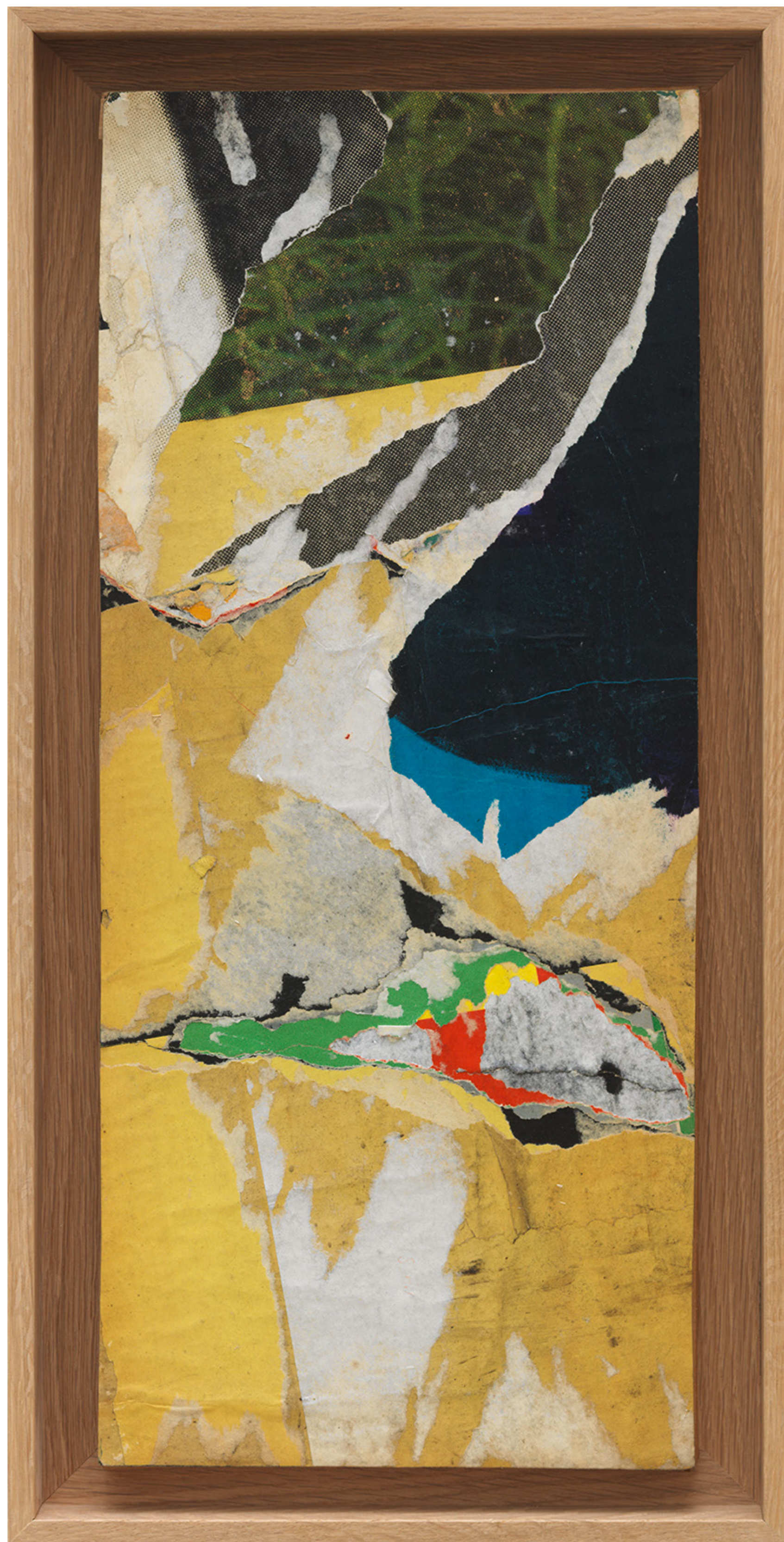
JACQUES VILLEGLE, Rue du Montparnasse, 31 mars 1964, 1964.

© JACQUES VILLEGLE; Courtesy of the artist.