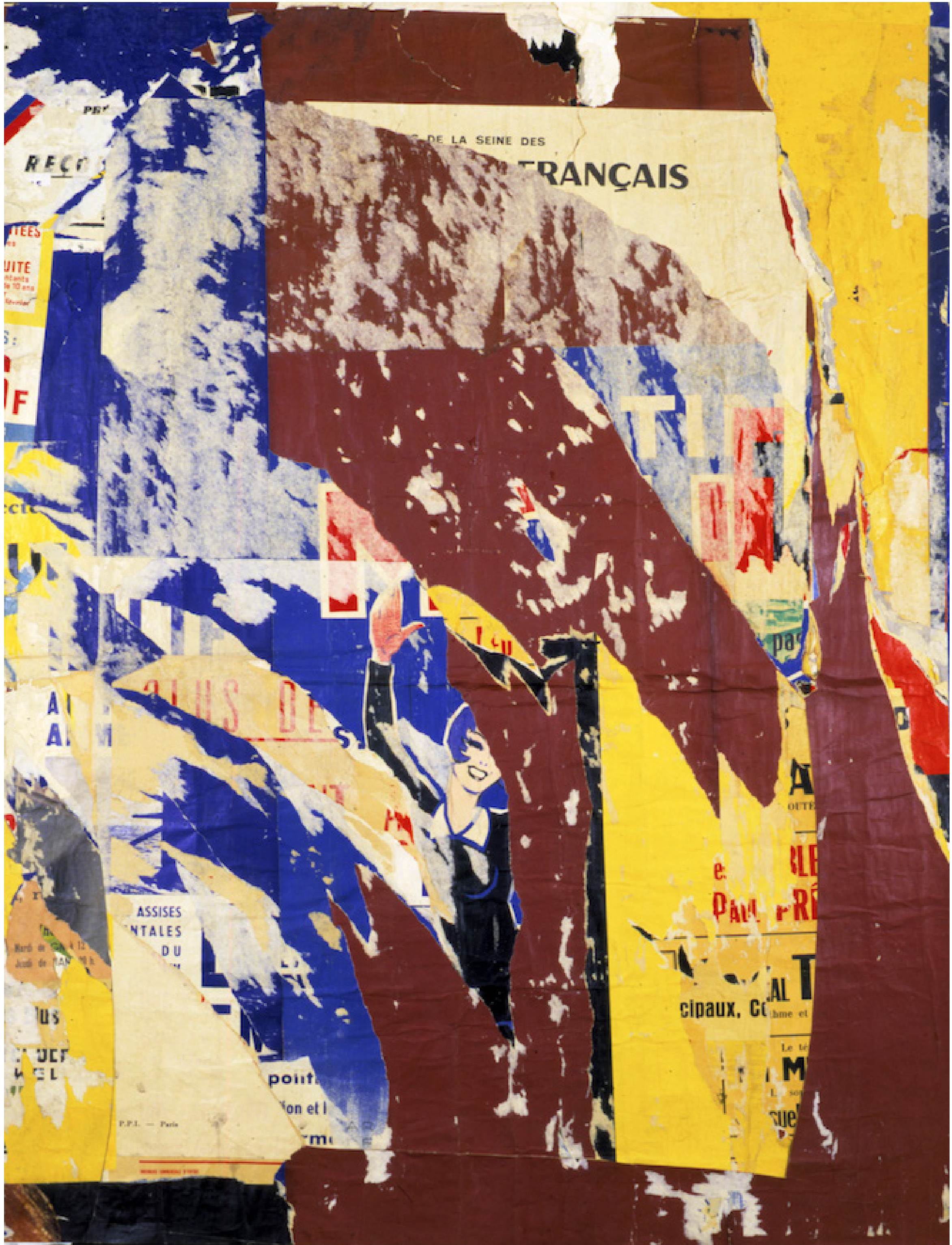
JACQUES VILLEGLE, Rue du Temple - Brune, 14 mars 1965, 1965.

© JACQUES VILLEGLE; Courtesy of the artist.