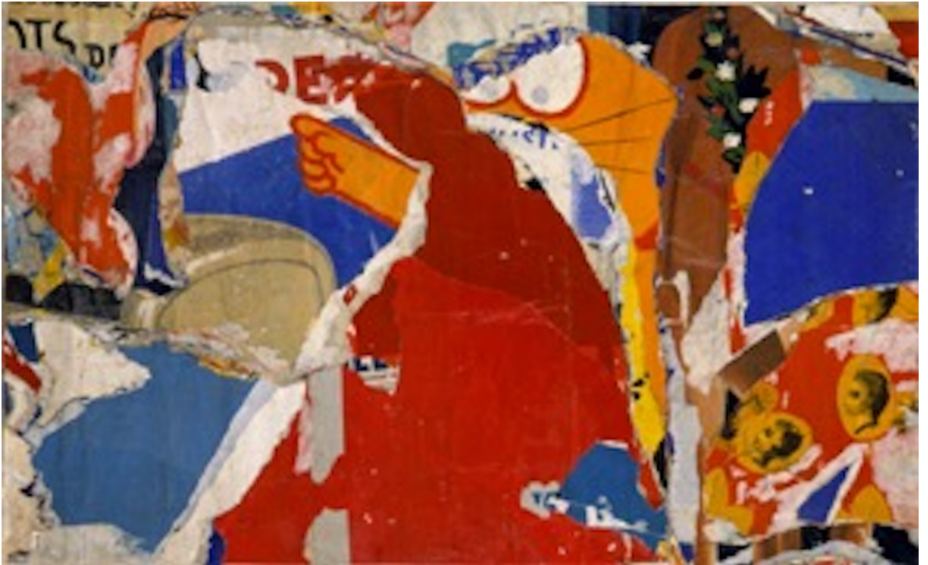
JACQUES VILLEGLE, Rue de Vaugirard , 17 février 1965, 1965.