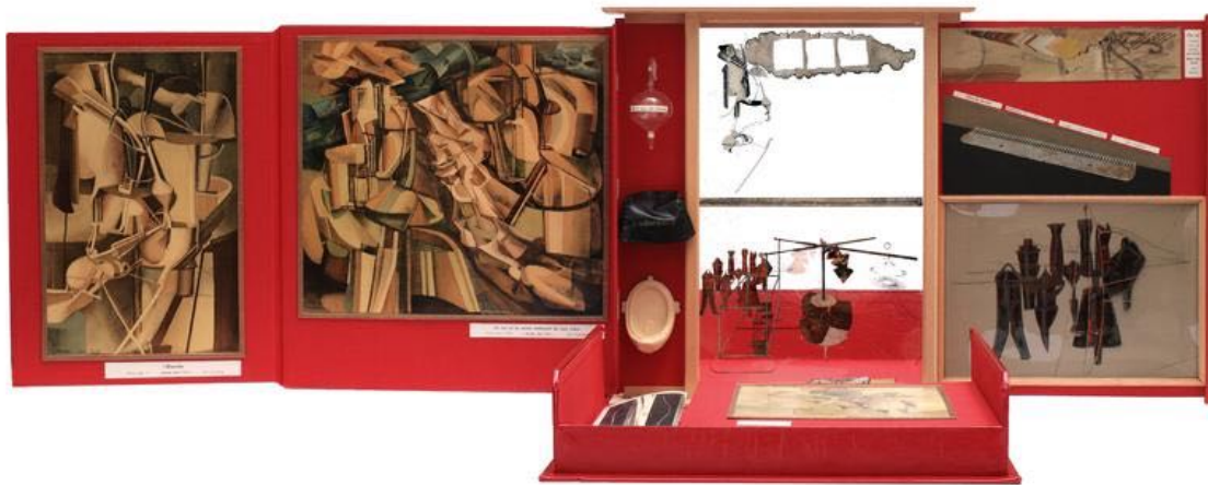
Marcel Duchamp, La boîte en valise : from or by Marcel Duchamp or Rose Selavy, 1941-1966