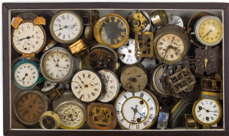
Arman, Paradoxe du Temps , 1961