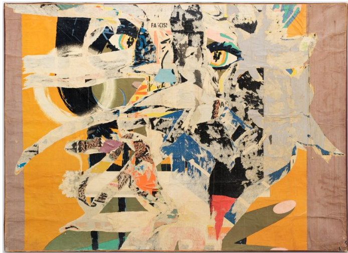
Raymond Hains, Untitled n°19 , 1962