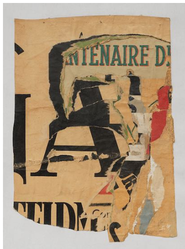
Jacques Villeglé, Boulevard du Montparnasse , 1950